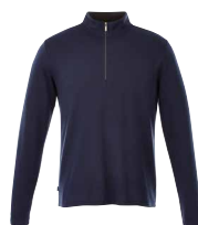
550 Metro Blue Heather

The Stratton Knit quarter for men's and half zip for women's offers a traditional professional look for men and women – with some key differences between the two. While the men's has a stand collar and fits well over a shirt and tie, the women's has a convertible collar, dropped back hem and tapered waist for a flattering fit. Both, however, are made with washable wool that makes it easy to wash and wear.