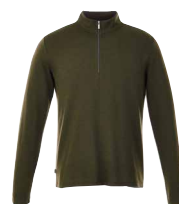
684 Loden Heather