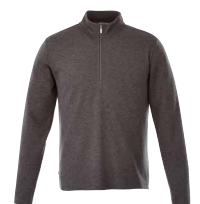
988 Heather Dark Charcoal