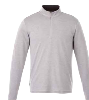
932 Heather Grey