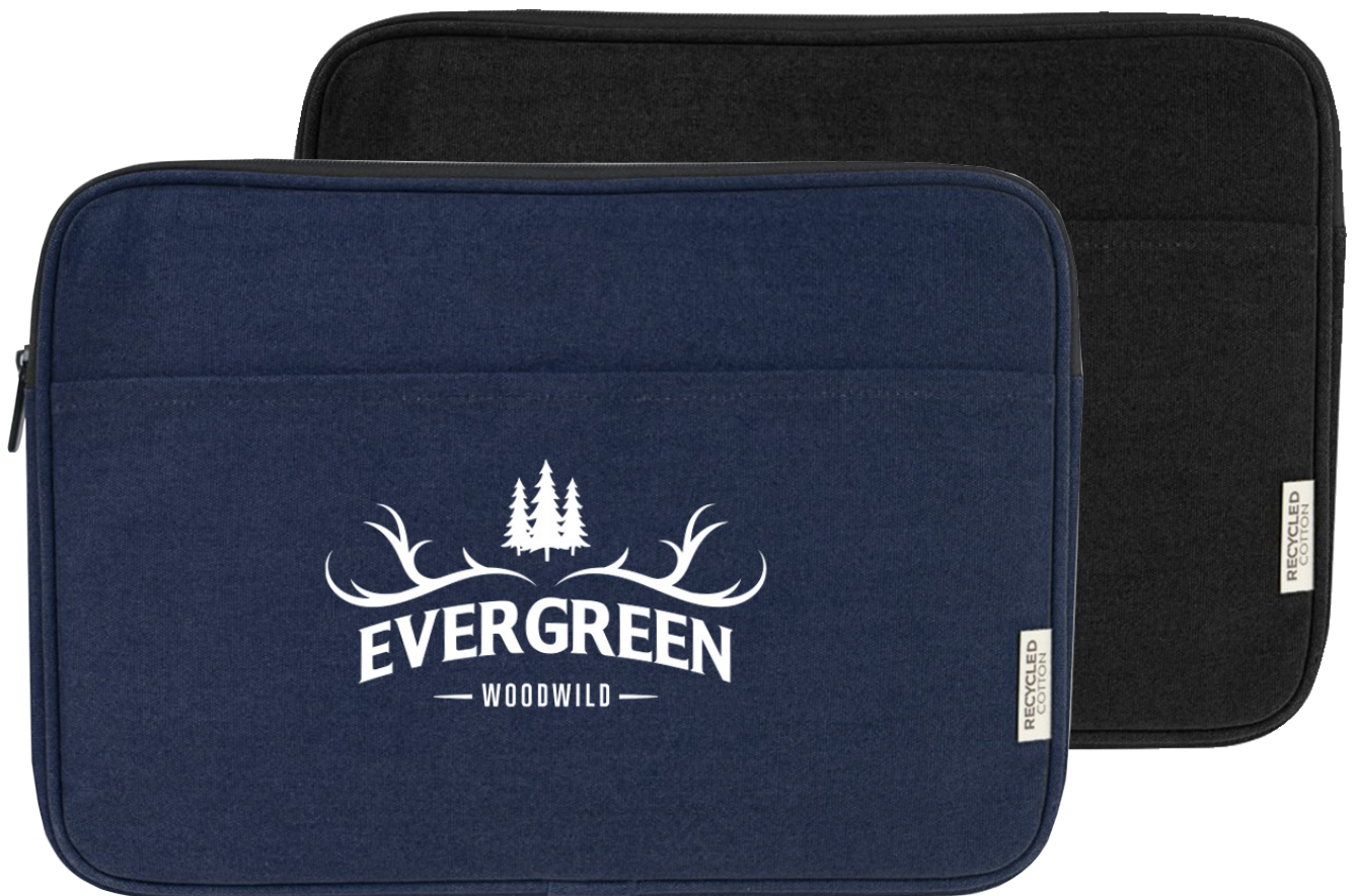
DA1006 | Darani GRS Recycled Canvas 16" Laptop RECYCLED PRE CONSUMER COTTON