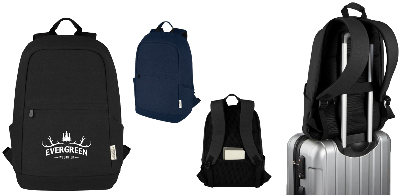
DA1007 | Darani GRS Recycled Canvas Anti-Theft 15" 21L Laptop Backpack GRS RECYCLED PRE-CONSUMER COTTON