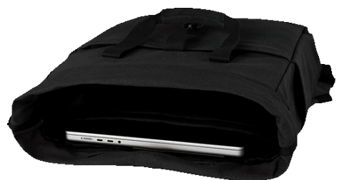
DA1009 | Darani GRS Recycled Canvas Backpack Tote 24L GRS-CONSUMER COTTON