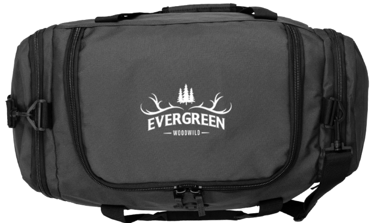
DA1004 | Darani Duffel Bag in Repreve Recycled Material 34L REPREVE RECYCLED 600d POLYESTER