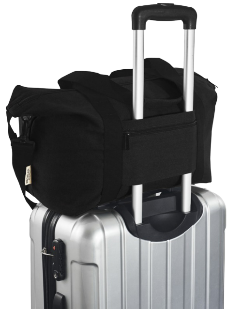
DA1008 | Darani GRS Recycled Canvas Sports Bag 26L GRS 4.0 CERTIFIED PRE-CONSUMER COTTON