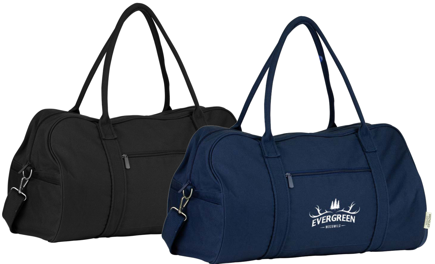
DA1015 | Darani GRS Recycled Canvas Duffel 48L GRS CERTIFIED RECYLED COTTON & POLYESTER