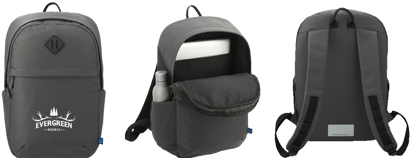
DA1003 | Darani 15" 19L Computer Backpack In Repreve Recycled Material REPREVE RECYCLED 600d POLYESTER