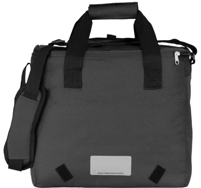
DA100 | Darani 36 Can Cooler In Repreve Recycled Material REPREEVE RECYCLED 600d POLYESTER