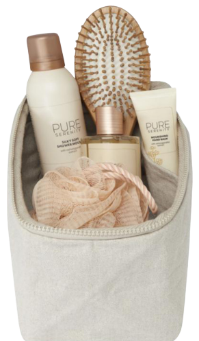
DA1017 | Toiletry Organiser 500 g/m² Aware RECYCLED COTTON & POLYESTER AWARE