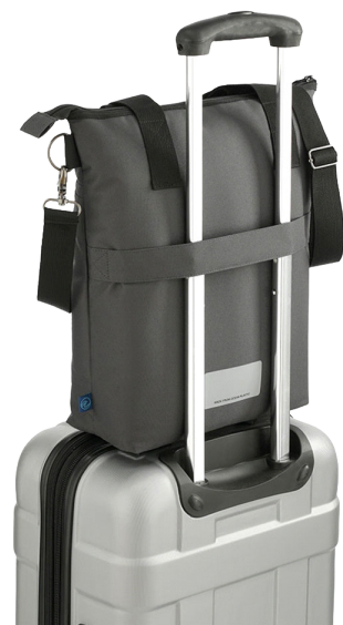
DA1002 | Darani Computer Tote In Repreve Recycled material REPREVE 600d POLYESTER