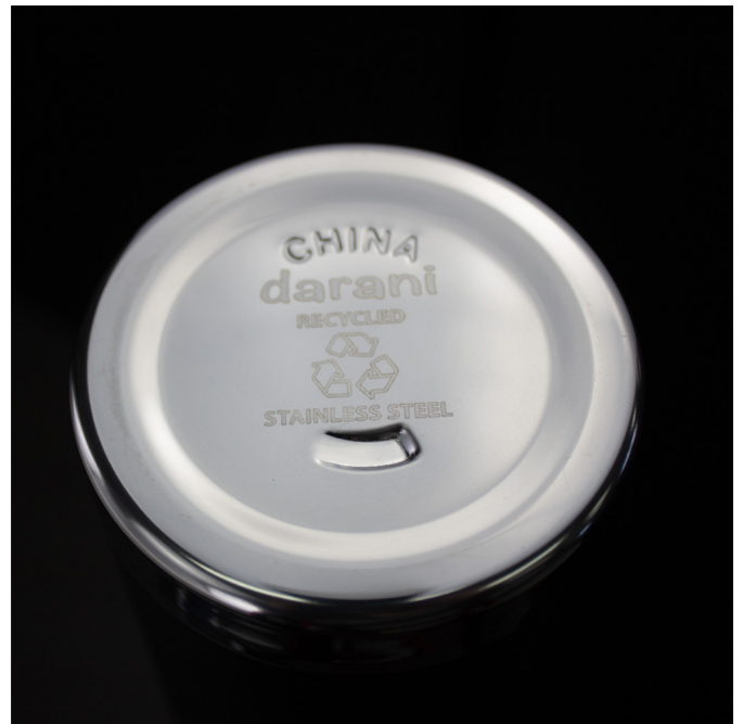
DA1012 | Darani Recycled SS Thor Copper Vacuum Insulated Bottle 650ml RECYCLED STAINLESS STEEL & RECYCLED PLASTIC