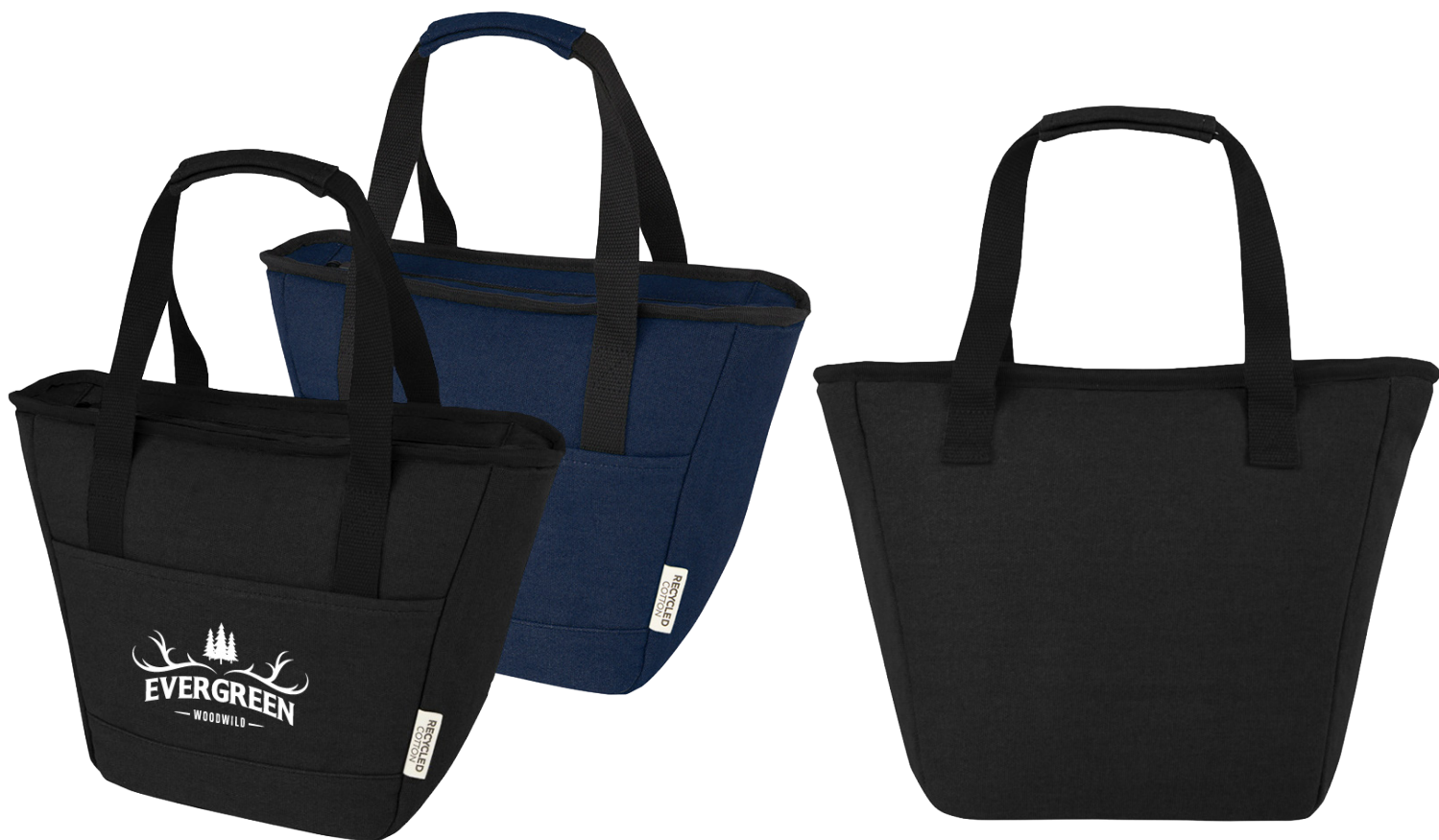
DA1001 | Darani GRS Recycled Canvas Cooler Tote 14L RECYCLED PRE CONSUMER COTTON