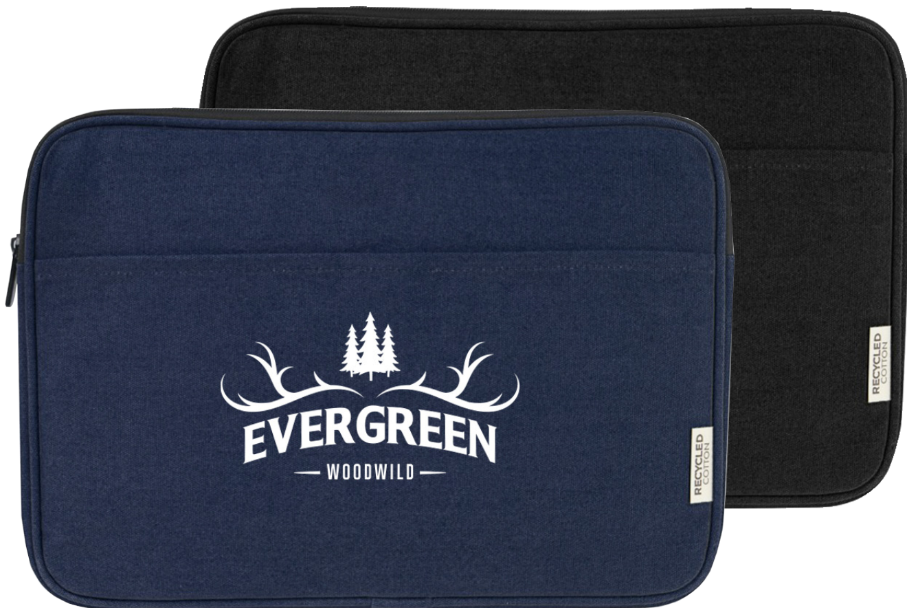
DA1006 | Darani GRS Recycled Canvas 16" Laptop RECYCLED PRE CONSUMER COTTON