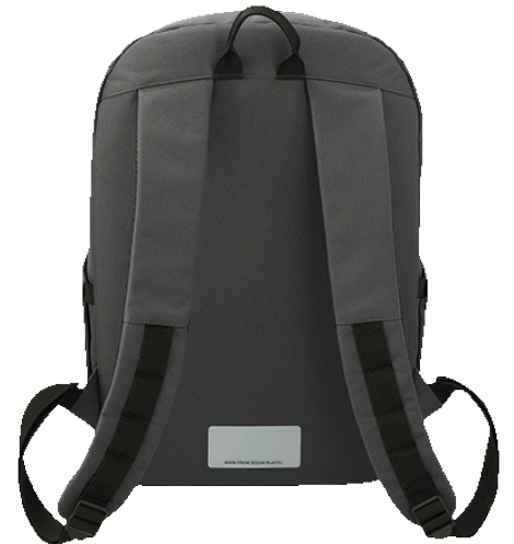
DA1003 | Darani 15" 19L Computer Backpack In Repreve Recycled Material REPREVE RECYCLED 600d POLYESTER