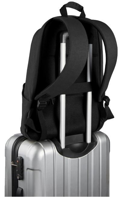
DA1007 | Darani GRS Recycled Canvas Anti-Theft 15" 21L Laptop Backpack GRS RECYCLED PRE-CONSUMER COTTON