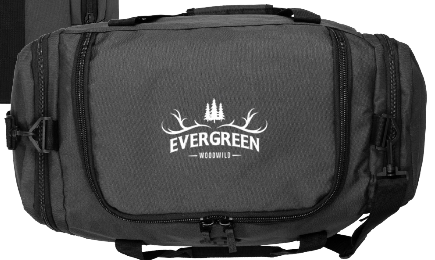
DA1004 | Darani Duffel Bag in Repreve Recycled Material 34L REPREVE RECYCLED 600d POLYESTER