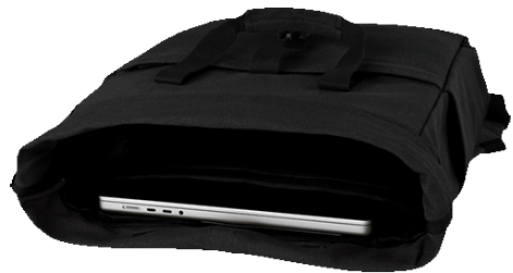
DA1009 | Darani GRS Recycled Canvas Backpack Tote 24L GRS-CONSUMER COTTON