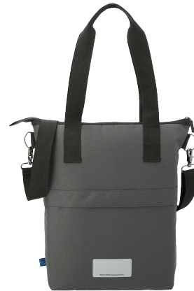
DA1002 - Darani Computer Tote in Repreve® Recycled Material