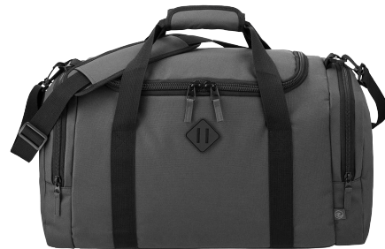
DA1004 - Darani Duffel Bag in Repreve® Recycled Material