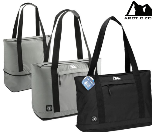
AZ1026 - Arctic Zone® Repreve® 25-50 Can Expandable Cooler 36L