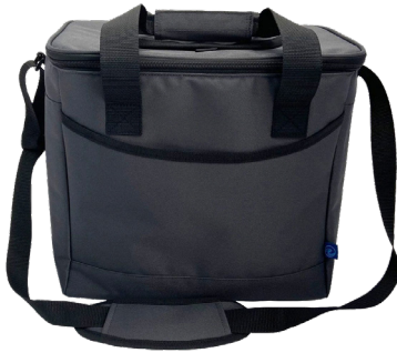
DA1001 - Darani 36 Can Cooler in Repreve® Recycled Material