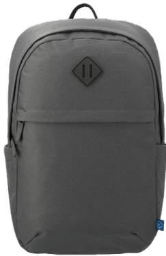
DA1003 - Darani 15 Inch Computer Backpack Repreve® Recycled Material