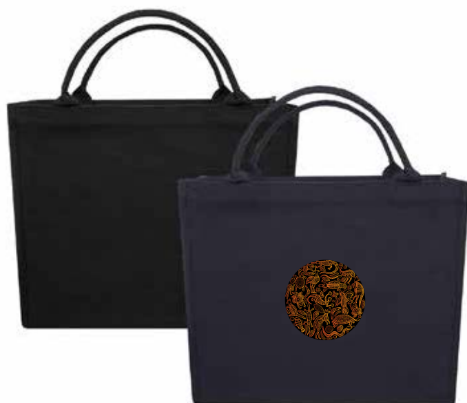
Darani Page Recycled Tote | DA1013