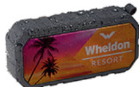
Speaker - top view

(For other decoration methods & size - please refer to the website)